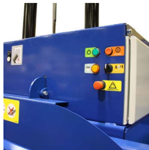
PLC-Control with automatic bale cycle