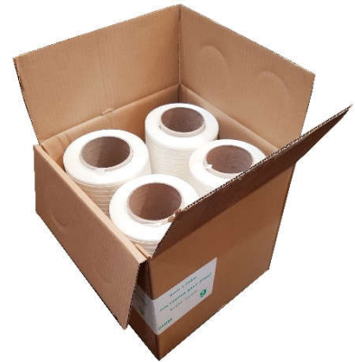
Strapping for 200MK BTS-WG40 (1box=8 spools)