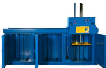
Extra Chamber BTS-MF75MK