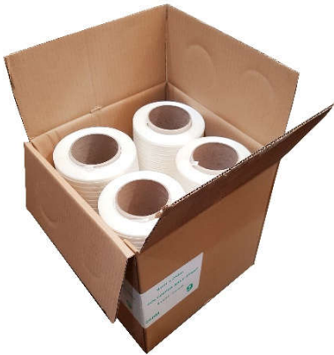
Strapping for 75MK BTS-WG30 (1box=8 spools)