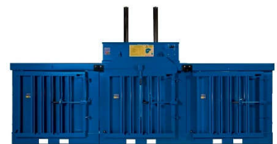
Extra Chamber BTS-MF200MK