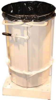
Insert for 240 L Waste bags