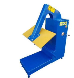
also available for 660 Lt. and 770 Lt. wheelie bins