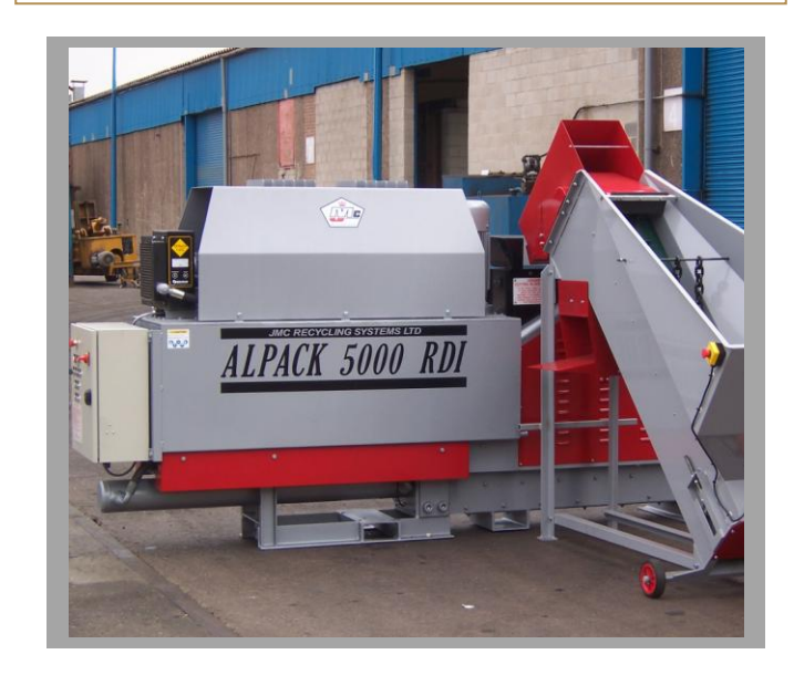
© 2014 Copyright JMC Recycling Systems Ltd. All rights reserved.

While we make every effort to ensure that our information is correct, technical data is for guidance only and subject to change. If any dimension or performance indication is important to you, please check with us before ordering.