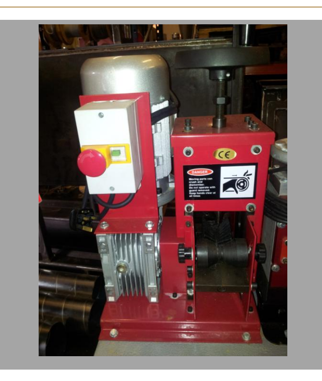
© 2014 Copyright JMC Recycling Systems Ltd. All rights reserved.

While we make every effort to ensure that our information is correct, technical data is for guidance only and subject to change. If any dimension or performance indication is important to you, please check with us before ordering.