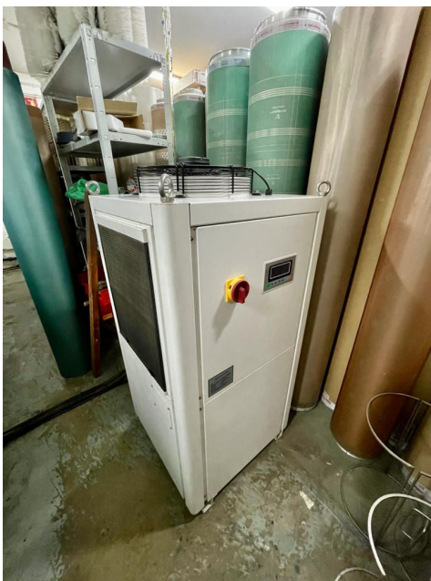
6.- Oil cooler