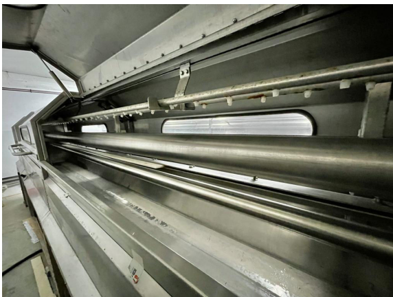
2.- Detail Ironing Machine